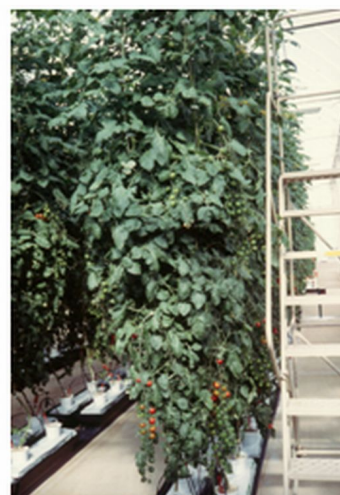
Figure 4. Rockwool hydroponic culture in a greenhouse in Lake Buena Vista, FL, 1998.

which do not recirculate the nutrients. In these systems, root infections remain localized.