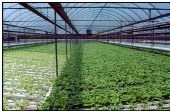
Figure 3. Bibb lettuce growing in a hydroponic system that uses nutrient film (flow) technique in a greenhouse in Live Oak, FL, 1995.

Because of the risk of root pathogens being spread throughout the greenhouse once an infection starts, most tomato growers are no longer using recirculating systems unless the system includes some means of sterilizing the water. Instead, many tomato and pepper growers now use some variation of a media nutrient flow-through system, such as the lay-flat bag, Dutch bucket or rockwool systems,