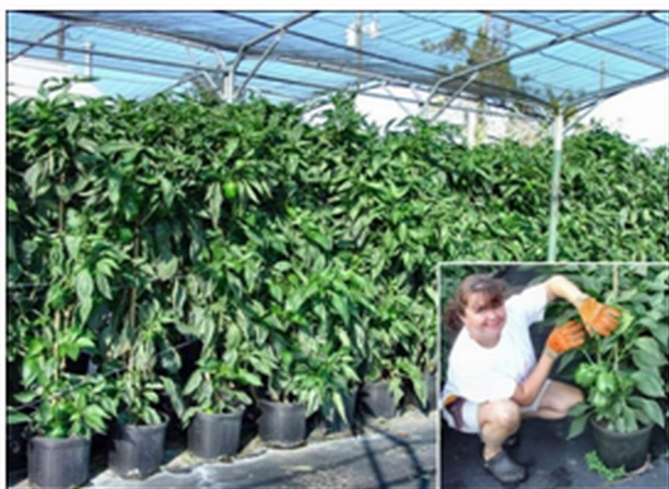
Figure 9. A hydroponic system outdoors, under shade, in Live Oak, FL, October, 2007.

Outdoor hydroponic systems typically are used with some provision for frost protection with row-cover materials. (See Figure 8). In addition, there is an increasing interest in extending the hydroponic growing season into the summer by using open shade structures (Hochmuth et al., 2007) to supply vegetables for local markets. (See Figure 9).