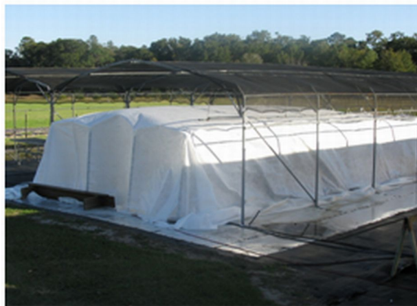
Figure 8. A tomato crop under a polypropylene frost cover outdoors in December, 2008, in Live Oak, FL.

While this publication generally focuses on information for greenhouse hydroponic production systems and crops, growing vegetables in greenhouses during the summer months in Florida can be problematic due to heat, humidity and pest buildup that can occur. Additionally, prices for vegetables are usually low during the summertime.