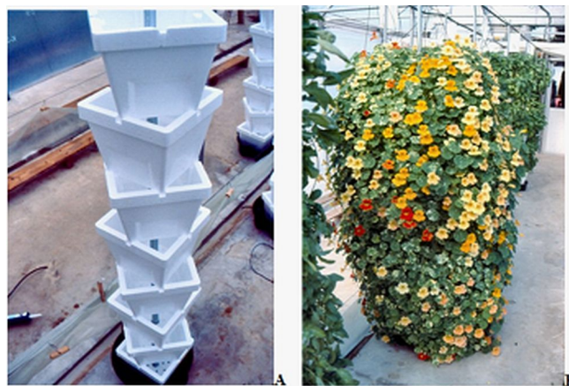
Figure 6. Verti-Gro ® stacked pots (A) planted with nasturtium (B) in a vertical hydroponic system in Live Oak, FL, 2001.

The vertical systems are popular for producing strawberries, leafy greens, edible flowers and fresh-cut herbs. More recently, vertical-production techniques have also been developed for tomato.